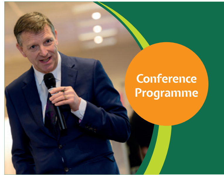
Hosted by BBC Home Editor, Mark Easton

Three streams of workshops: STRATEGIC, OPERATIONAL & PROCUREMENT