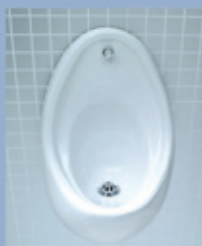
50cm Concealed Urinal Boxed Packs (bowl, cistern, auto siphon, pipework, waste, top inlet spreader and brackets).