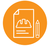
CAPITAL & PLANNED INVESTMENT