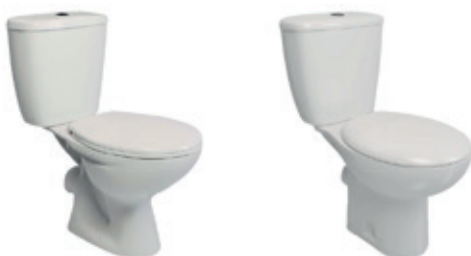
Atlas Trade Close Coupled WC Pack