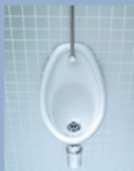
40cm/50cm Exposed Urinal Boxed Packs (bowl, cistern, auto siphon, pipework, waste, top inlet spreader and brackets).