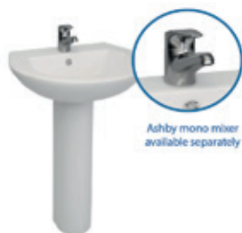
Atlas Trade 55cm 1 Tap Hole Basin and Pedestal Pack