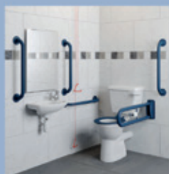
Close Coupled Doc M Pack Blue Rails. Also available in white and grey.