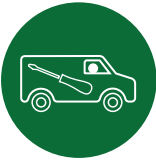
MATERIALS & MERCHANTS