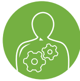
BUILDING SAFETY & COMPLIANCE