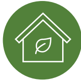
DECARBONISATION & RENEWABLES